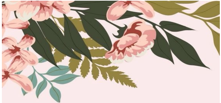
Front cover from She Reads Truth

the steadfast love of the Lord never ceases His mercies never come to an end; they are NEW every morning great is your faithfulness. LAMENTATIONS 3:22-23