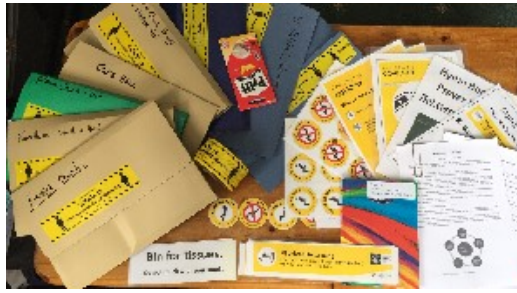
Covid-19 Packs for Fanlobbus and Kinneigh Union Churches and Halls.

We have been live streaming the services for the last three months and we will be continuing to do this from the 11am service in Dunmanway.