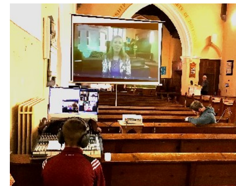
First Online service from St. Mary's Church on Sunday 21st July.