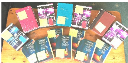
Bibles and handbooks to the bible for pupils leaving Dunmanway Model School this year.

It is a tradition in Fanlobbus Union that we